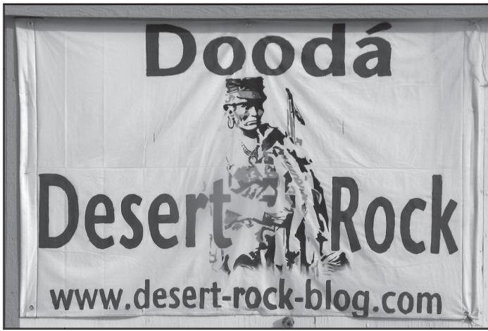
Protest sign near Desert Rock Power Plant site.